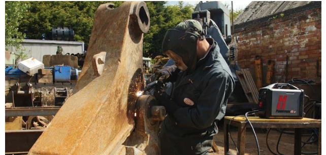
Maintenance and repair