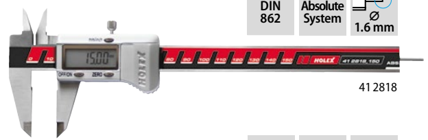
DIN 862 Absolute System