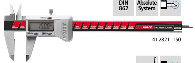
DIN 862 Absolute System