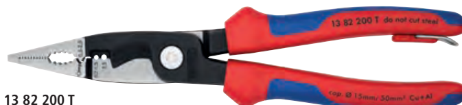
13 82 200 T