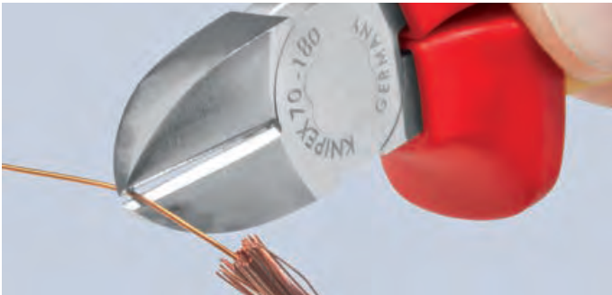
Clean cutting of thin copper wires, also at the cutting edge tips