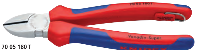
70 05 180 T