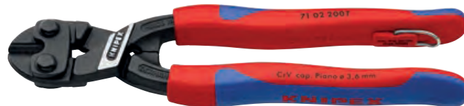
71 02 200 T