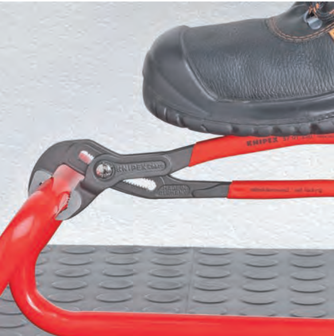
Teeth set against the direction of rotation have a self-locking effect and prevent slipping on the workpiece.