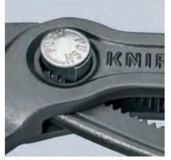
Fine adjustment by pushing a button: fast and comfortable

No more time-consuming presetting of the required opening size. Just position the upper jaw to the workpiece, push button and move close the lower jaw, ingeniously simple.