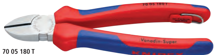
70 05 180 T