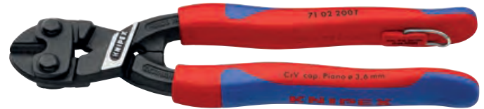
71 02 200 T