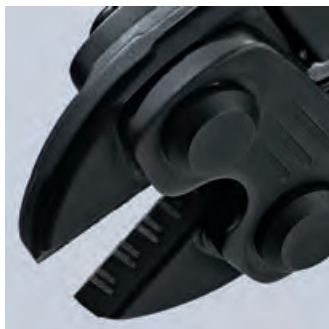
Micro-structured cutting edge allows easy cutting of large cross-sections

Pliers with tether attachment point for mounting a fall protection