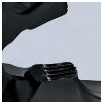
With gripping surface below the joint for gripping and pulling wires with a diameter as from 1 mm