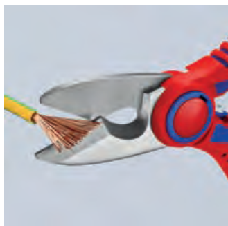
No slipping thanks to micro-serration