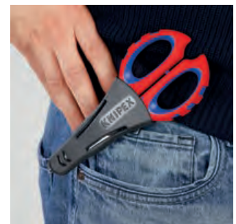
Safely stored and ready to hand at all times