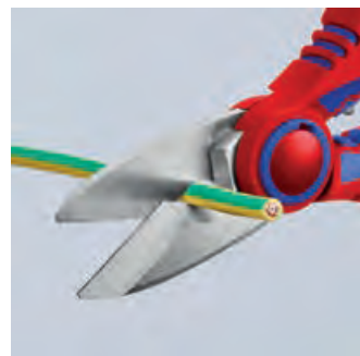
Integrated cable cutter