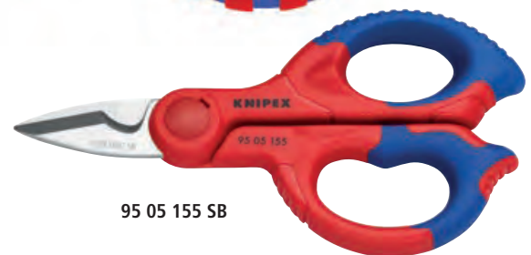
95 05 155 SB