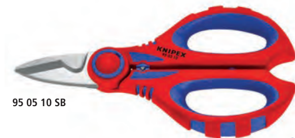
95 05 10 SB